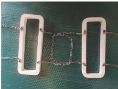
Assembly and Forming

Formed from N17 material or nanofibers, it has low density, relatively high strength, high lightweight buoyancy, and no pollution to molten metal, and can be used for multiple casting cycles. The impurity separation ring is used with the casting crystallizer. By installing the impurity separation ring, the filtered aluminum liquid first enters the annular range formed by the slag ring body. Slags such as oxidized slags may be carried into the crystallizer, the slag ring body can intercept slags like oxidized slags outside, preventing them from flowing into the inner side of the impurity separation ring.